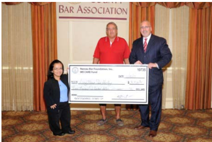
Long Island Sled Hockey