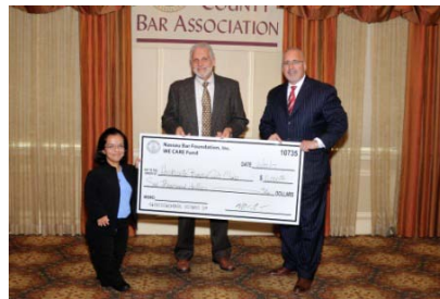
Hicksville Boys & Girls Club